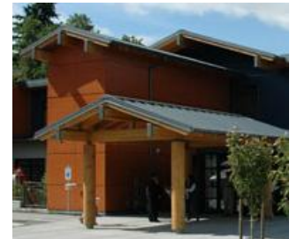
ACRS Office Building

The objective of I&A service is to support individuals and families in caring for themselves or their loved ones. Finding what you need when you need is not always easy. To help seniors of King County and their caregivers, I&A support helps clients navigate many agencies, and their services and resources. All communications with clients and their personal information are kept strictly confidential.